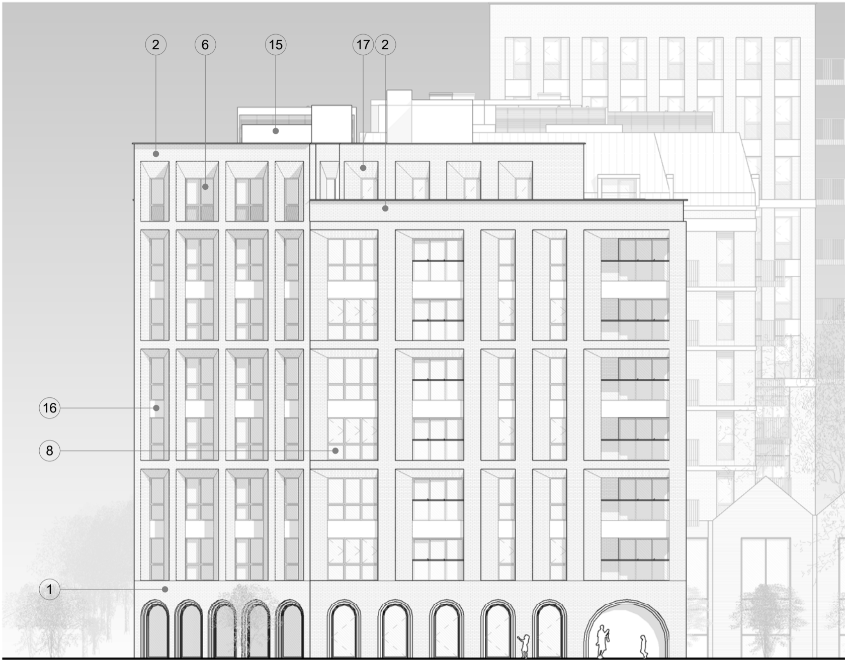
2 Building 1 - South Elevation 1 : 200