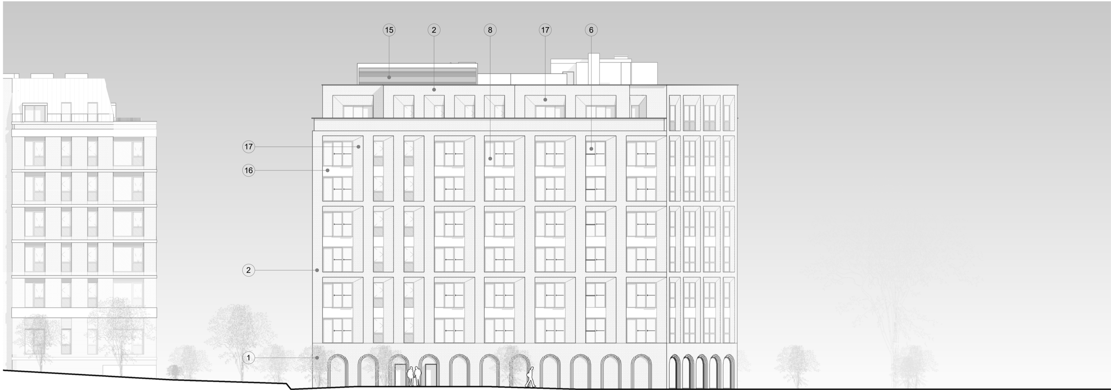
1 Building 1 - West Elevation 1 : 200