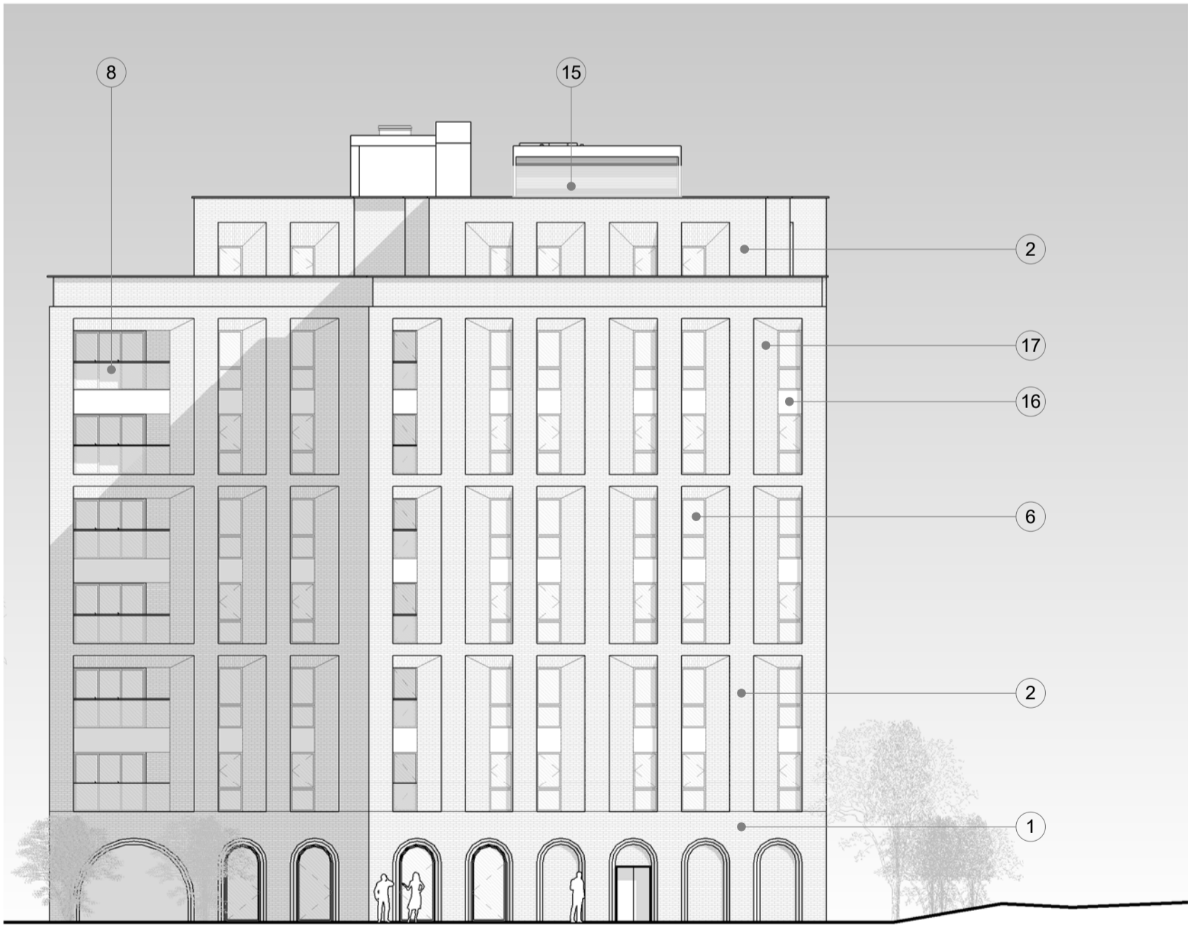
4 Building 1 - North Elevation 1 : 200

NOTES CONSULTANTS - Refer to highways consultant's drawings for details - Refer to landscape consultant's drawings for details - Landscaping layout is indicative only AREAS - Refer to area schedule © Copyright Reserved. ColladoCollins Architects Ltd