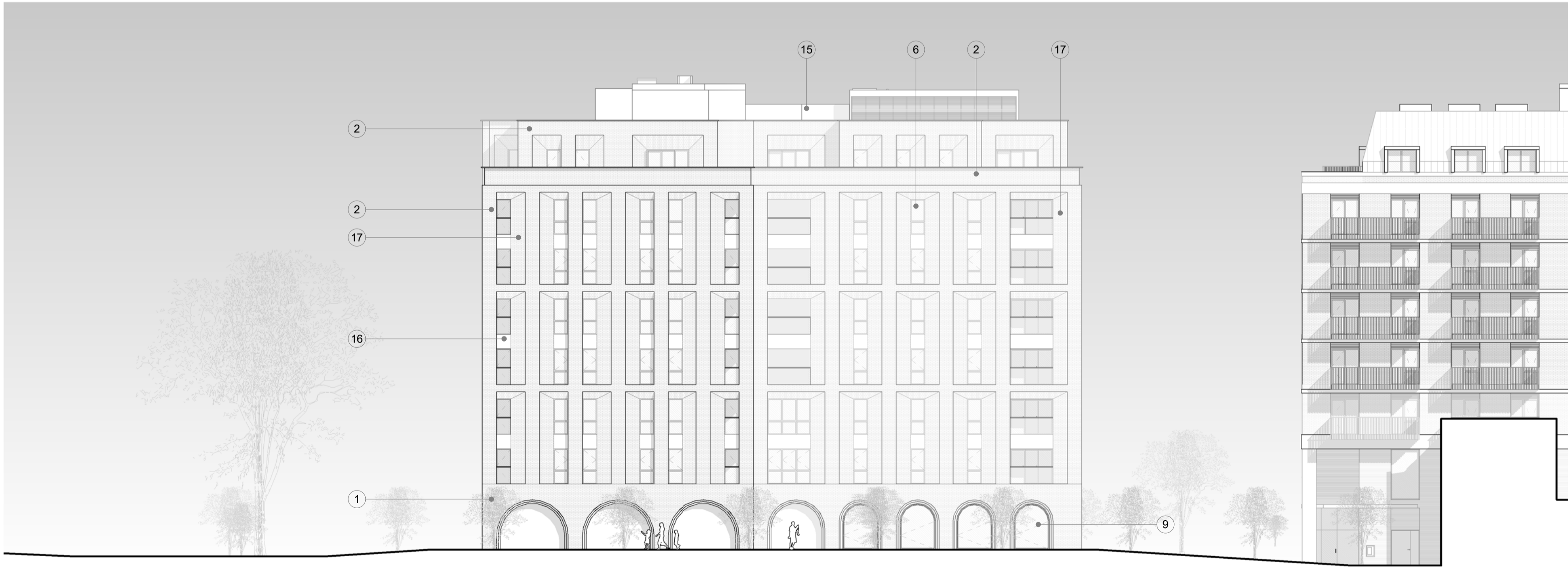
3 Building 1 - East Elevation 1 : 200